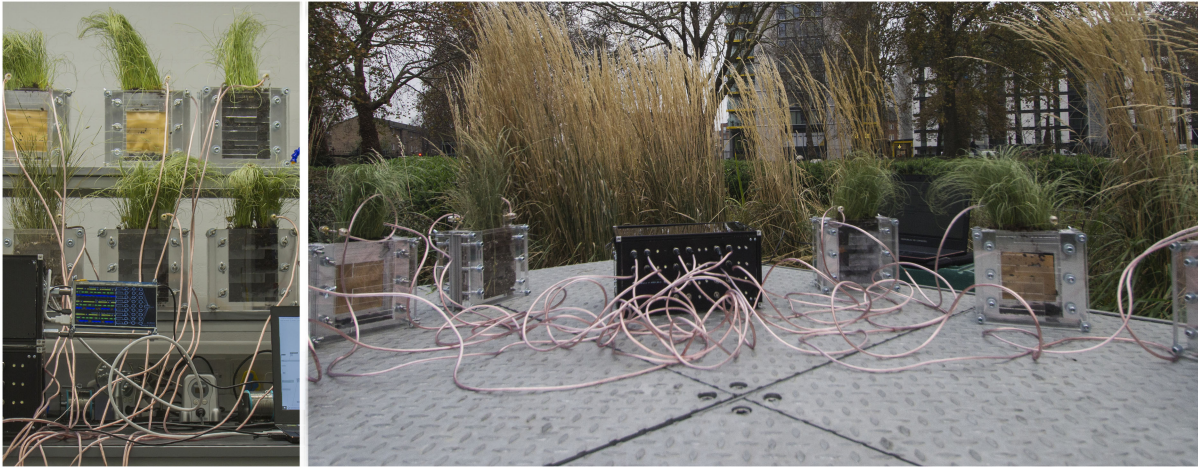
FIGURE 3. Alt-C is another example of a system where Michael couples artificial and natural elements that are not explicitly mentioned in the interview. Alt-C is an installation that uses electricity produced by plants to power a single board computer mining a cryptocurrency. Other examples can be explored at michaelsedbon.com .

With conventional robots, we have a silicon-based memory where we store variables and behavior from past time. It would be good to understand how our brains do it. This is a very beautiful area of study that touches upon the nature of intelligence, cognition, and computation. It's also a beautiful challenge to engineering to make a system completely out of neurons.