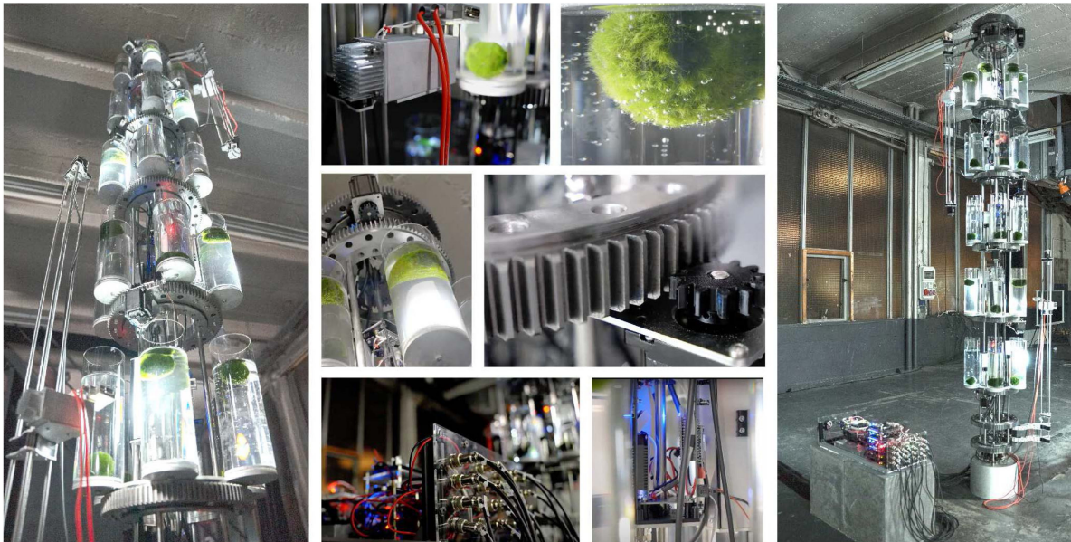
FIGURE 1. As new kinds of machines interacting through hard, soft, and wet mediums find applications in various fields such as medicine, computing, architecture, and design, they also deeply question our conception of the nature of life and machines. Cryptographic Beings is a technological proposal that leverages our ability to control and abstract biology to perform digital information storage.

living marimo (filamentous algae originally found in Northern Japan in Northern Europe). During photosynthesis, they produce gas vesicles visible to the naked eye. When enough bubbles are produced they become buoyant and float on the surface.